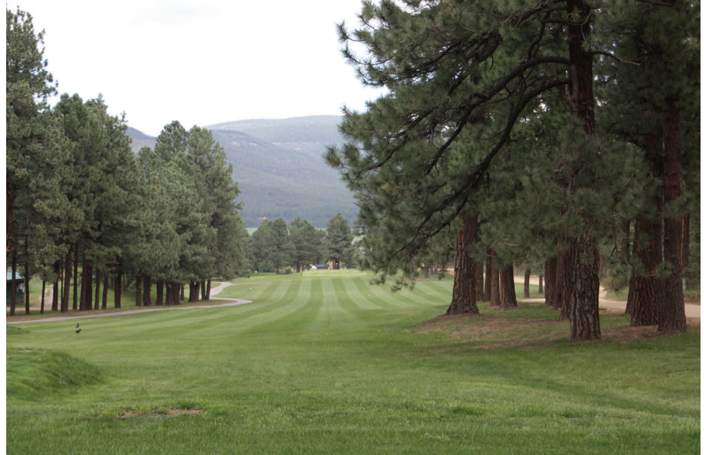
This picture was taken of the first tee at Pendaries during last year's LCC Foundation Golf Tournament.

Prizes will be given for longest drive (men & women's division) and closest to the pin