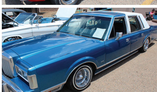
The 9th Annual Luna Community College Car Show on Saturday, June 15 had 65 entries. Approximately 700-1000 people attended the event throughout the day.