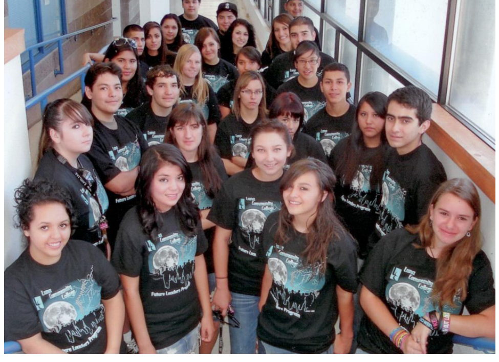
Future Leaders Program students take time to take a group photo last year. LCC has been offering summer programs for youth for nearly one quarter of a century.

Luna Community College is offering two enhanced college credit summer programs for upcoming high school juniors and seniors along with 2012 graduating seniors. The first is a Student Academic Advancement Institute (SAAI) which is available to high school students who will be classified as a junior or senior next school year. The second is a Future Leaders Program (formerly known as the Tech Prep Summer Program) which is available to high school students who will be classified as a junior or senior next school year and also for students who will be 2012 graduating seniors. This program will be offered under the Department of Science,