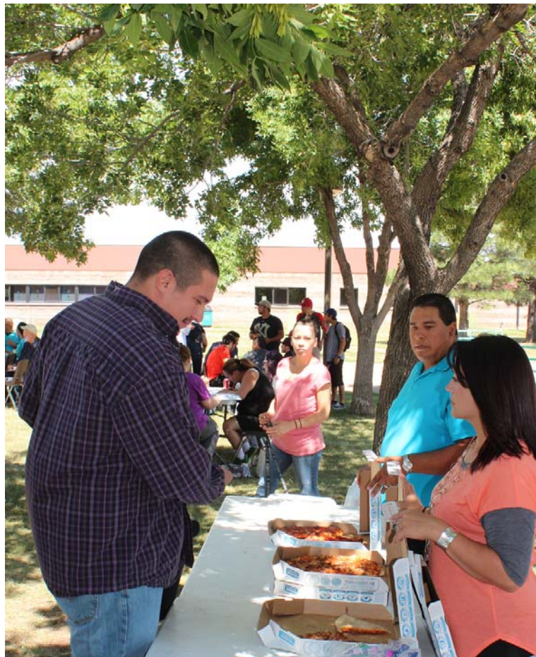
Luna Community College students enjoyed music and food recently during a pizza party sponsored by the LCC ACCESS Center.