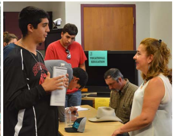
Luna Community College directors and instructors met with several dozen students from the Springer and Santa Rosa area during their orientation recently.