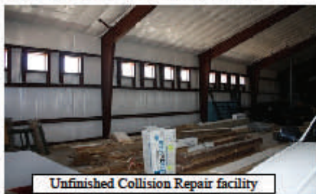
Unfinished Collision Repair facility