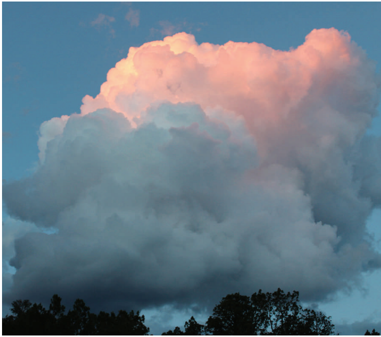
Although this particular cloud did not produce moisture, northern N.M. has been getting some much-needed rain recently.