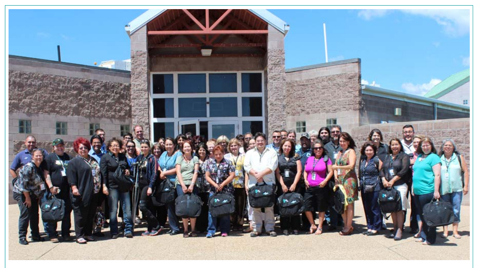
A group of Luna Community College employees took time to take a photo after orientation last week. Luna Community College wants to wish all students a great fall semester.