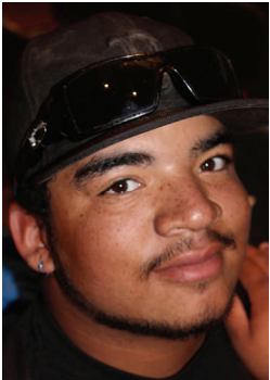
Jordan Hall Silver City Criminology

"I'm pretty excited; it's a new experience. I want to have a good career and go into forestry and be a game warden."