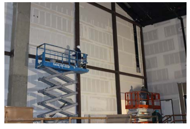
Substantial progress is being made every week at the Media Education Center. When finished, the Media Education Center will have seating for 1,100.