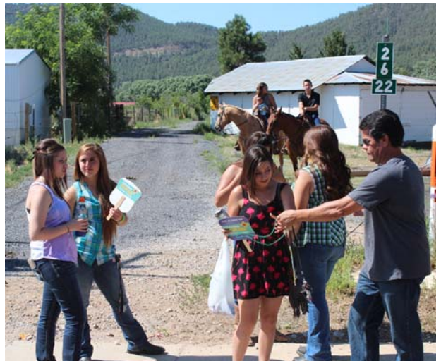
LCC: "The People's College"