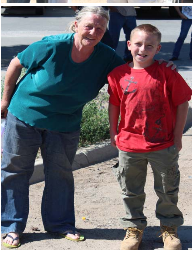
LCC: "The People's College"