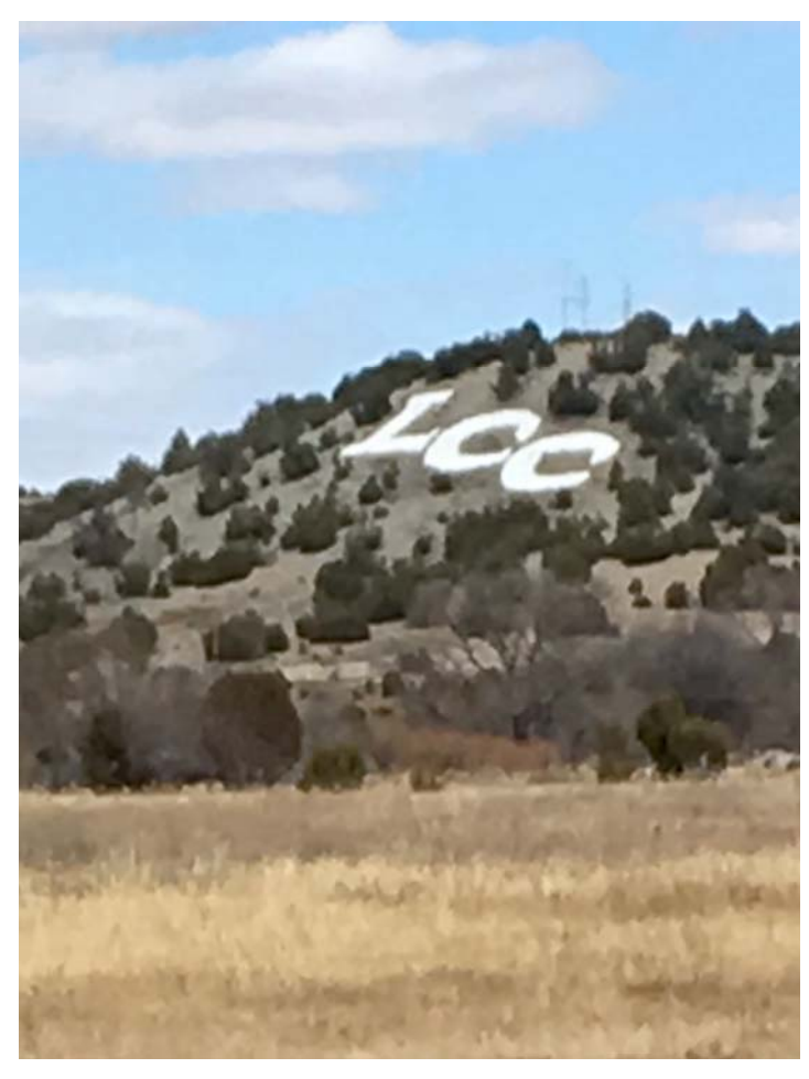
The LCC Signature Rocks can be seen near mile marker 344 on I-25. This is the finished version.

Higher Learning Commission Peer Reviewers met with Luna Community College Board of Trustees on Monday, March 19. The HLC Peer Reviewers met with students, administrators, faculty, staff and community members during their visit. The HLC Peer Reviewers will submit their report on Luna Community College to the Higher Learning Commission on or before Wednesday, April 18.