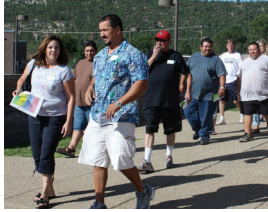
“The People’s College”