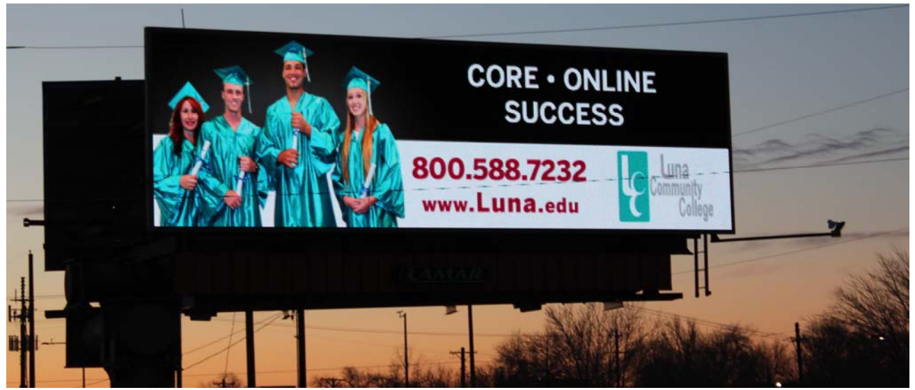
This Luna Community College digital billboard is located on 152 Montano Rd. NW and the weekly impressions for the digital billboard is right around 73,000.

Notes: There will be a combined induction ceremony for both fall and spring Phi Theta Kappa inductees sometime in February or March.