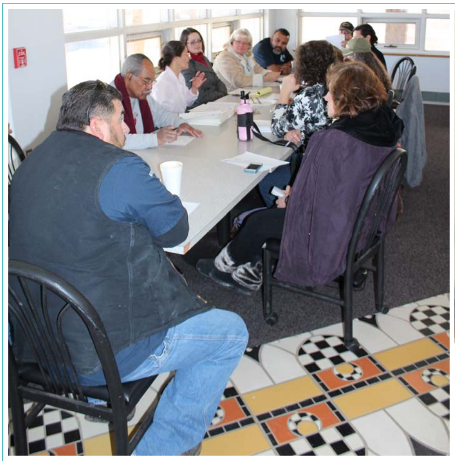
The last faculty senate meeting of the semester was held on Wednesday morning at the IPC. The January meeting will be held on Tuesday, Jan. 7.

From students, faculty, staff, administration and Board of Trustees: Luna Community College wishes everyone a very safe and happy holiday.