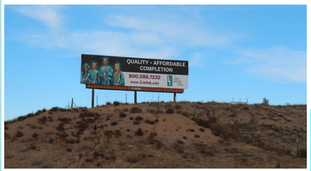
This Luna Community College billboard is located on mile marker 240 on 1-25. The weekly impressions for this billboard is right around 147,000.