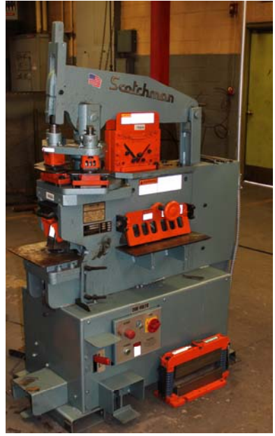
Anyone wishing to view the new equipment or tour the vocational area, can call 505/454-2530.

Register now for spring classes. Classes start on Monday, Jan. 13