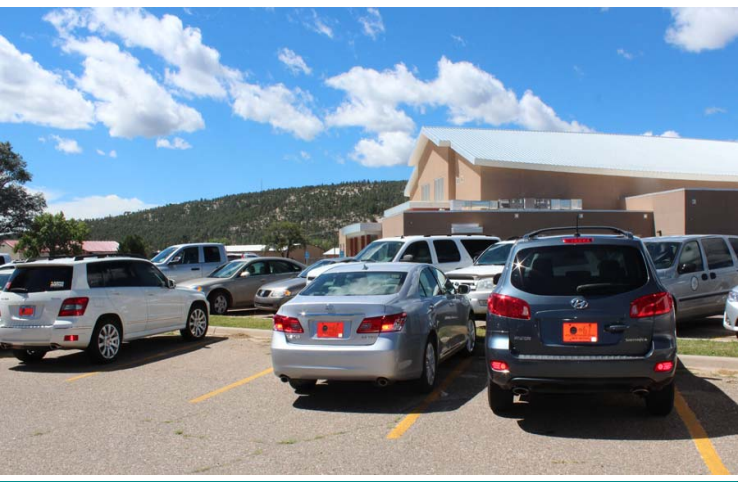
LCC: "The People's College"