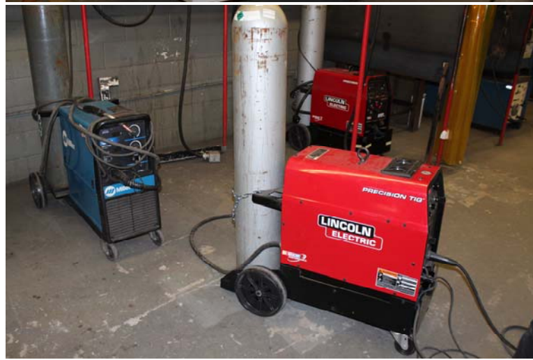
LCC welding students built the bed for this truck. The truck carries a compressor and a portable welder. The bottom photo shows new tigg welders.