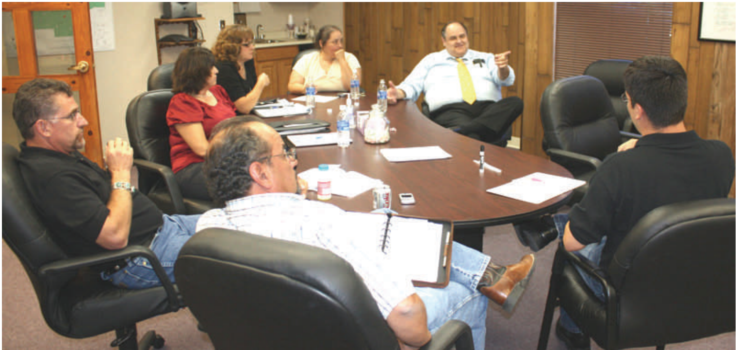
Luna Community College officials met with school administrators from East Las Vegas, Mora, Pecos and West Las Vegas Schools concerning the LCC Charter Academy on Friday. A community meeting on the charter academy has been scheduled at 4 p.m. on Thursday, Aug. 27 at the Leveo Sanchez Lecture Hall at Highlands University.