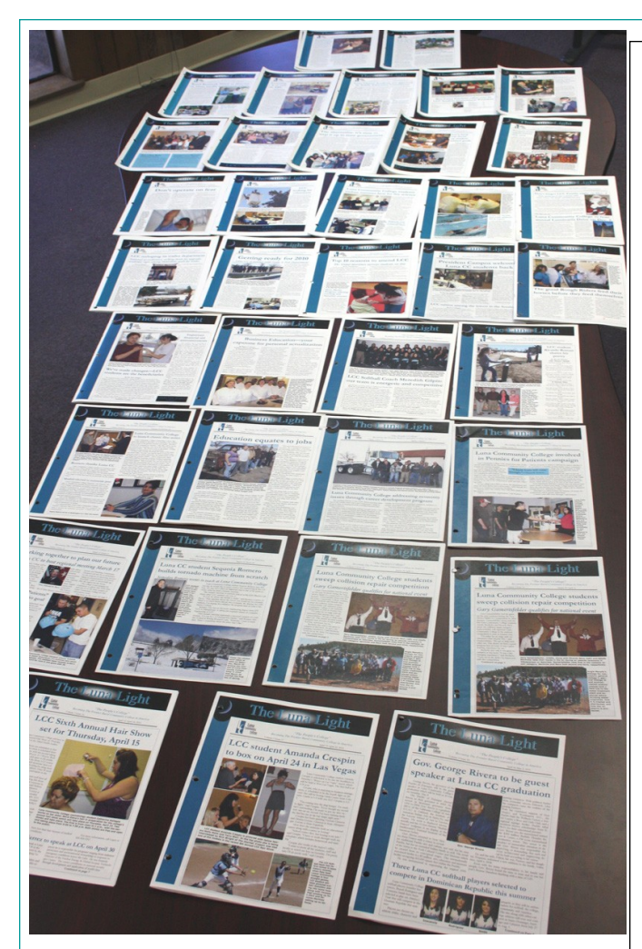
To catch up on The Luna Light, go to www.luna.edu and look under newsletters.