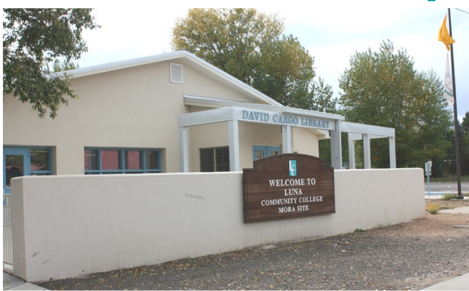
The Luna Community College-Mora Site is located in the heart of Mora. A recent visit by LCC employees was well-received by Mora High students.

dents in attendance by speaking on the importance of self-motivation in terms of both academic and personal choices. His speech was