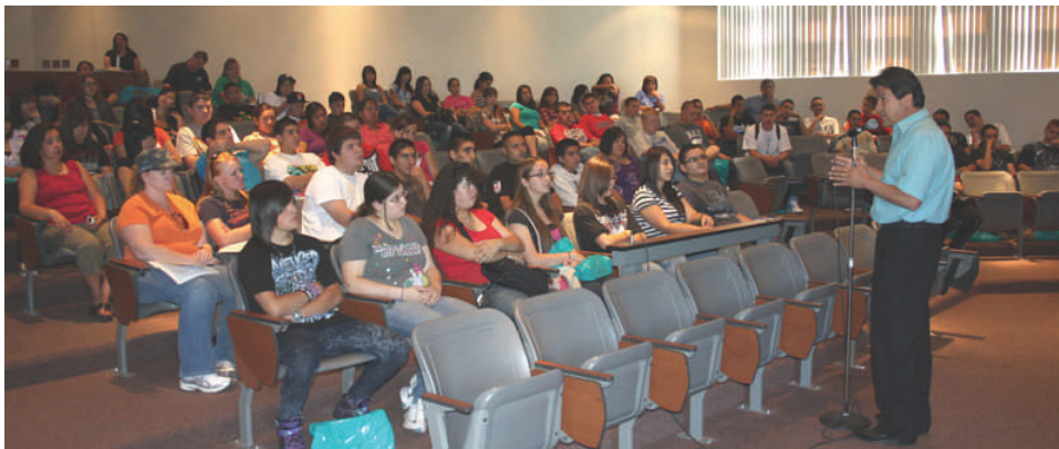
LCC: "The People's College"