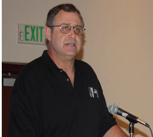
The 2010 Luna Community College Athletic Orientation took place on Friday, Aug. 6.