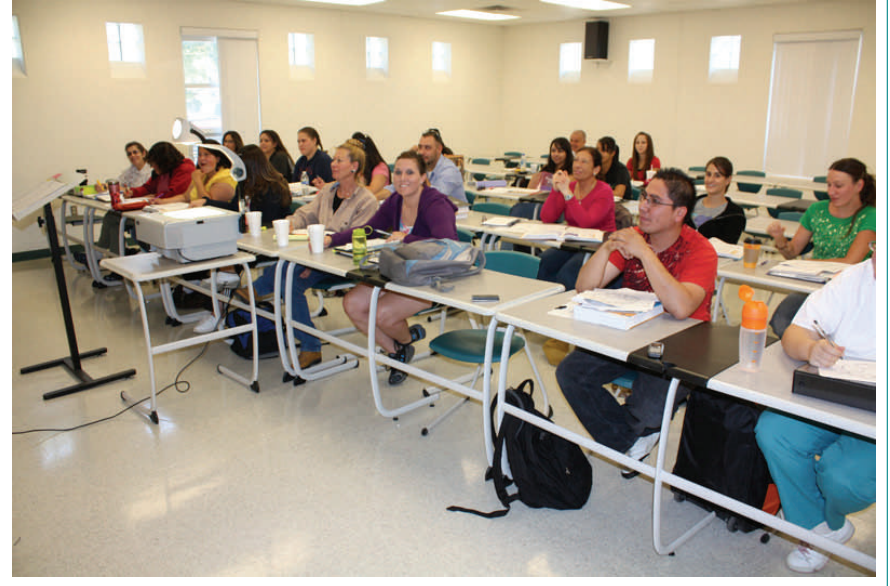
This group are a part of 45 new students who are beginning their first level nursing studies with enthusiasm and dedication to their exciting new journey.