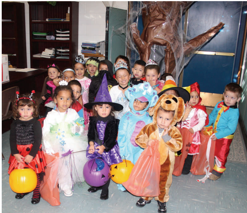
Luna Community College Day Care students take time for a photo as they trick and treated across campus recently.