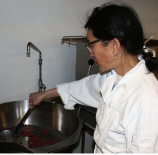
LCC: "The People's College"