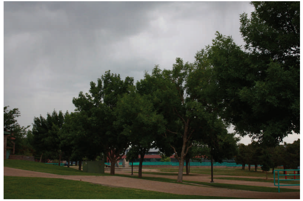
Luna Community College is considered to have one of the nicest campuses in the state.

As we all know the effect of the GO Bond Community College considering building not passing with regards to Luna is that Luna will not receive much needed monies to renovate the Vocational Areas on campus. But to