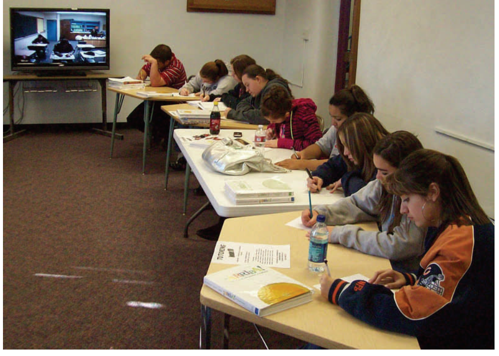
Students take an ITV class at the Springer Satellite.

We were also very instrumental in providing an online class to a new "Career Pathways" program that allowed Raton High School students an opportunity to receive dual -credit along with preparing them for a career in the medical field. Luna Community College partnered with the Raton Public Schools, Miners' Colfax Medical Center, and New Mexico Highlands University to work on this two-year program initiative. Luna Community College delivered the online curriculum beginning with BIO102 Medical Terminology during the 2010 fall and is presently registering student for PSYC101 Introduction to Psychology which will be offered in the spring. MCMC provided the clinical aspect of the two-year program where students received hands on experience which allowed students to work side by side with a mentoring healthcare team.