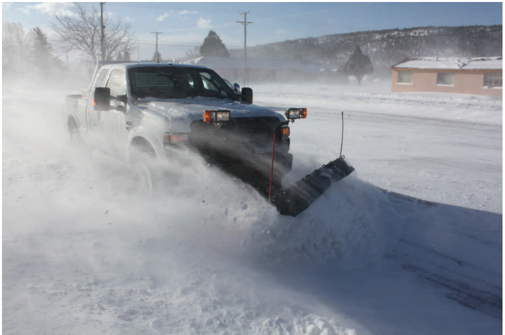
These are a couple of photos of a powerful snowstorm that hit Las Vegas last Tuesday.