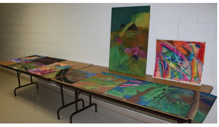
Adrian Jaramillo, a student in Luna Community College's intro to drawing class, stands with his artwork at the courses final exhibition on Dec. 7. The top photo shows examples of artwork from the fall 2009 introduction to drawing class.