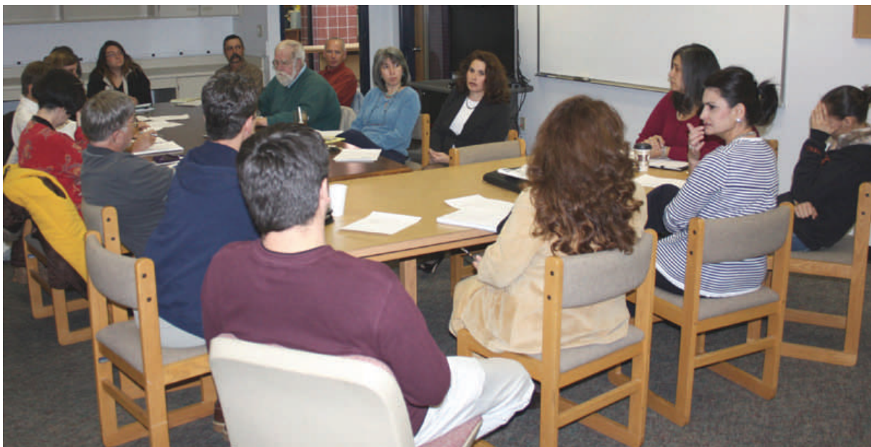
Directors from the Luna Community College Student Services and Academic Departments meet to plan and streamline summer and fall 2010 semester registration processes.