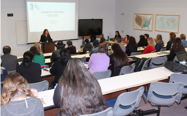
Luna Community College faculty took part in an in-service the week of Dec. 10. They met on course learning outcomes assessment, academic organization, Higher Learning Commission criteria 3 and 4, general core certification process, disability forms and procedures, assessment, tutoring and campus life.