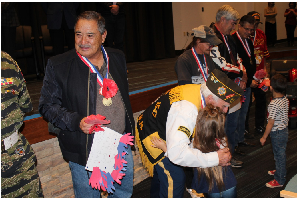
Las Vegas-area veterans accept gifts and hugs from children during the 2019 Veterans Day recognition ceremonies at Luna. This year's event will be available online via the college's Facebook page.

This year also marks the 101 st anniversary of Armistice Day.