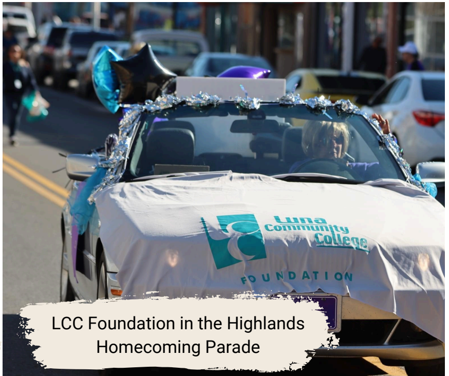
LCC Foundation in the Highlands Homecoming Parade