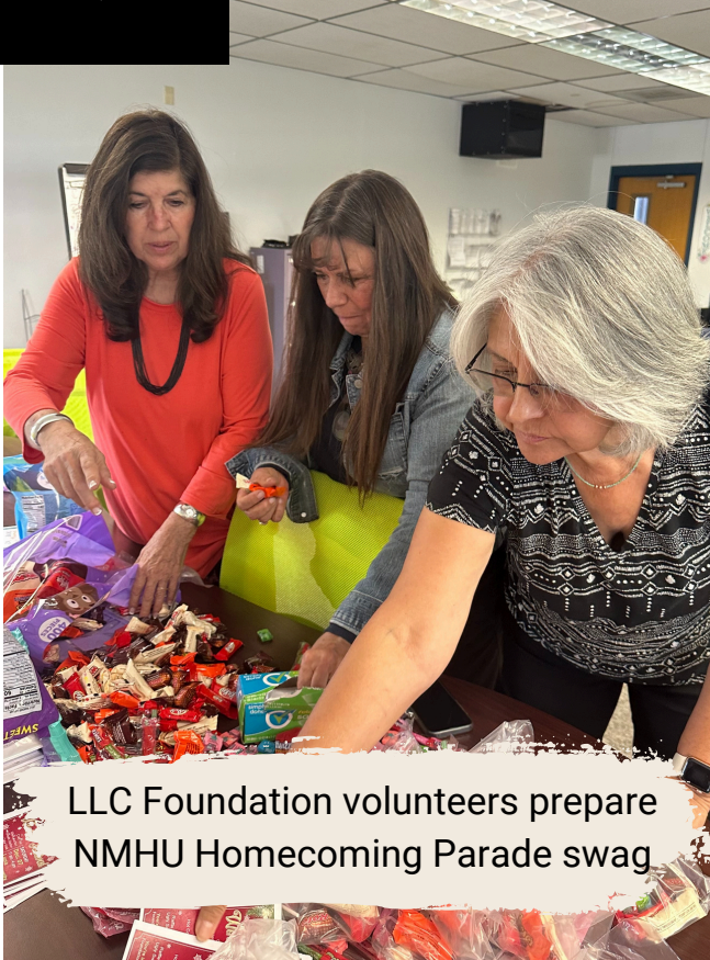
LLC Foundation volunteers prepare NMHU Homecoming Parade swag