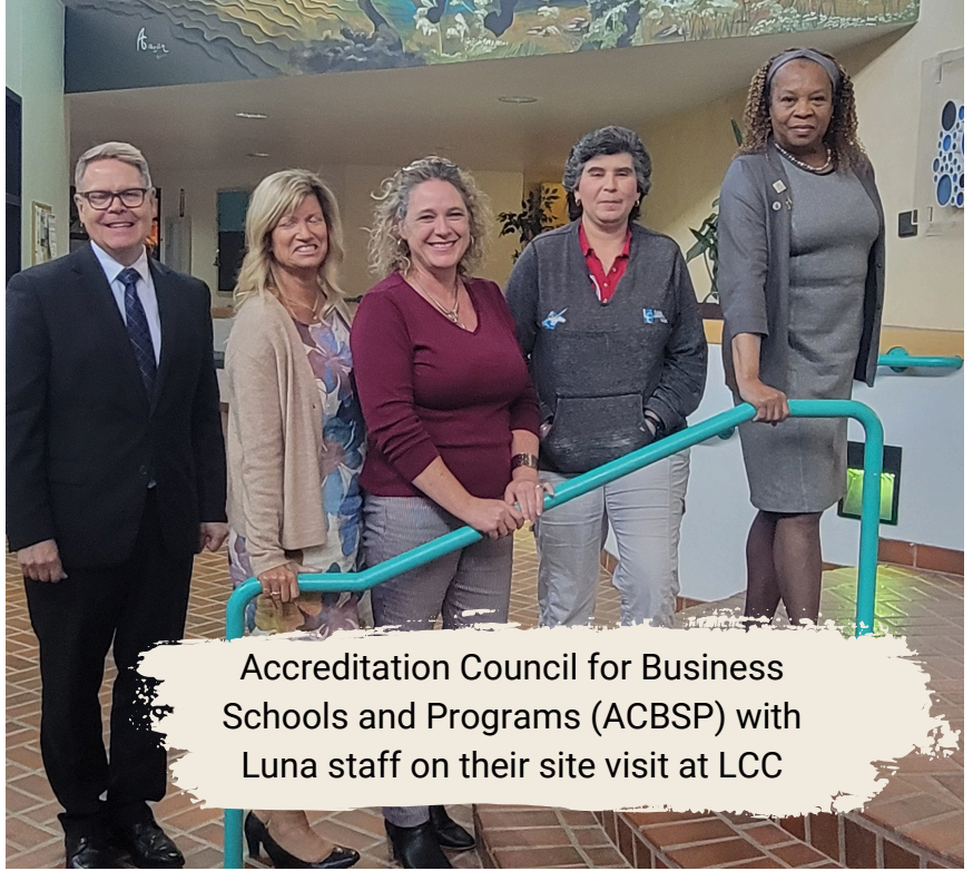
Accreditation Council for Business Schools and Programs (ACBSP) with Luna staff on their site visit at LCC