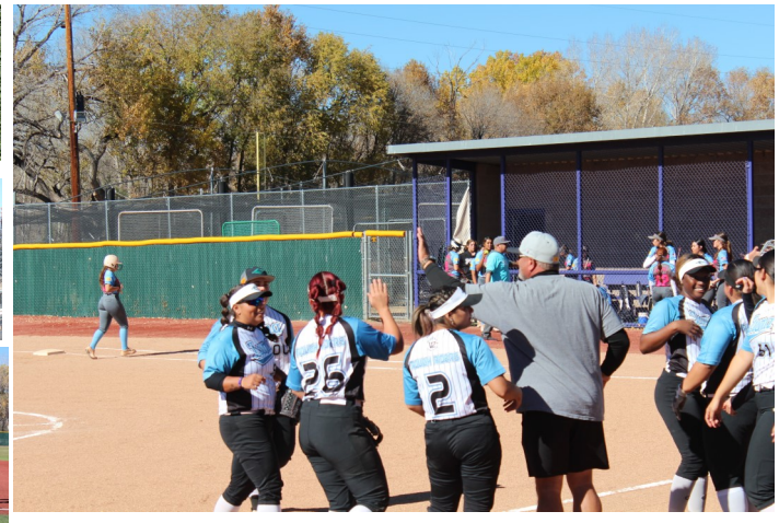
Luna student-athletes, coaches, employees and community enjoyed Appreciation Day on Sunday, Nov. 6.