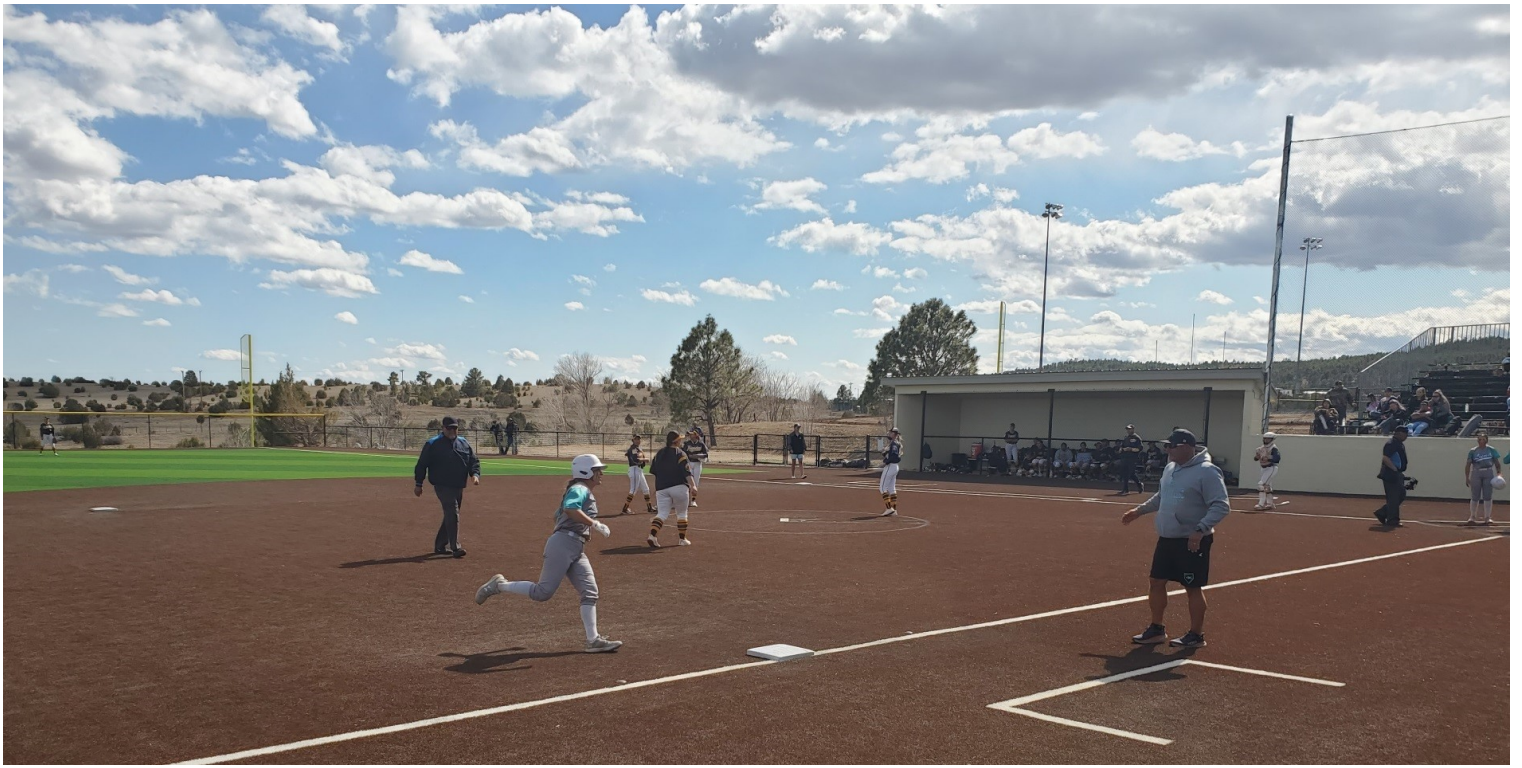
The Luna Community College softball team split two games with Trinidad Junior College recently at Rodriguez Park. The Lady Rough Riders are scheduled to play at Northeastern Junior College Friday and Saturday. The Luna baseball team is scheduled to play Lamar Community College at home on March 28.