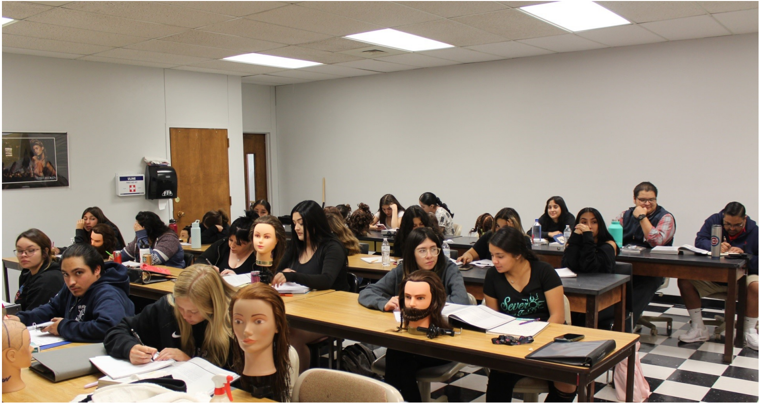
First year cosmetology and barbering students work on a theory assignment, recently.