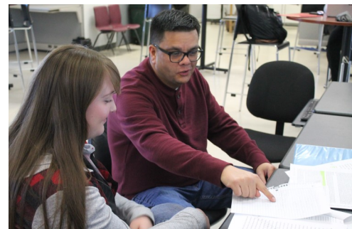
Students and tutors make use of study time in Luna's Academic Center for Excellence.