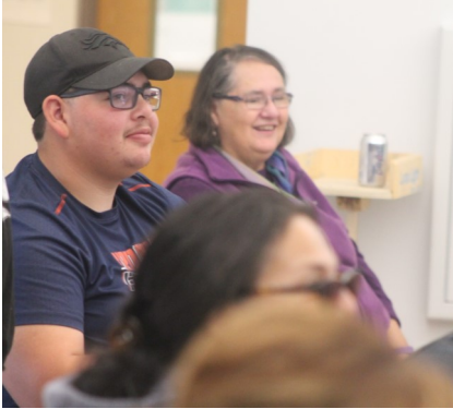
Audience members and participants enjoy another Reading On The Hill event Nov. 19 at the Luna Humanities atrium.