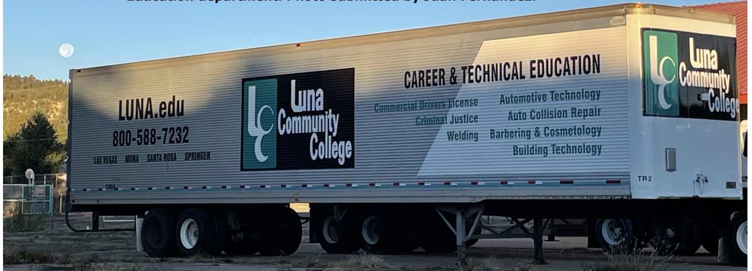
Photo of the Edition: A recent full moon provided a fine backdrop for Luna's CDL trailer, which promotes programs in its Career & Technical Education department.