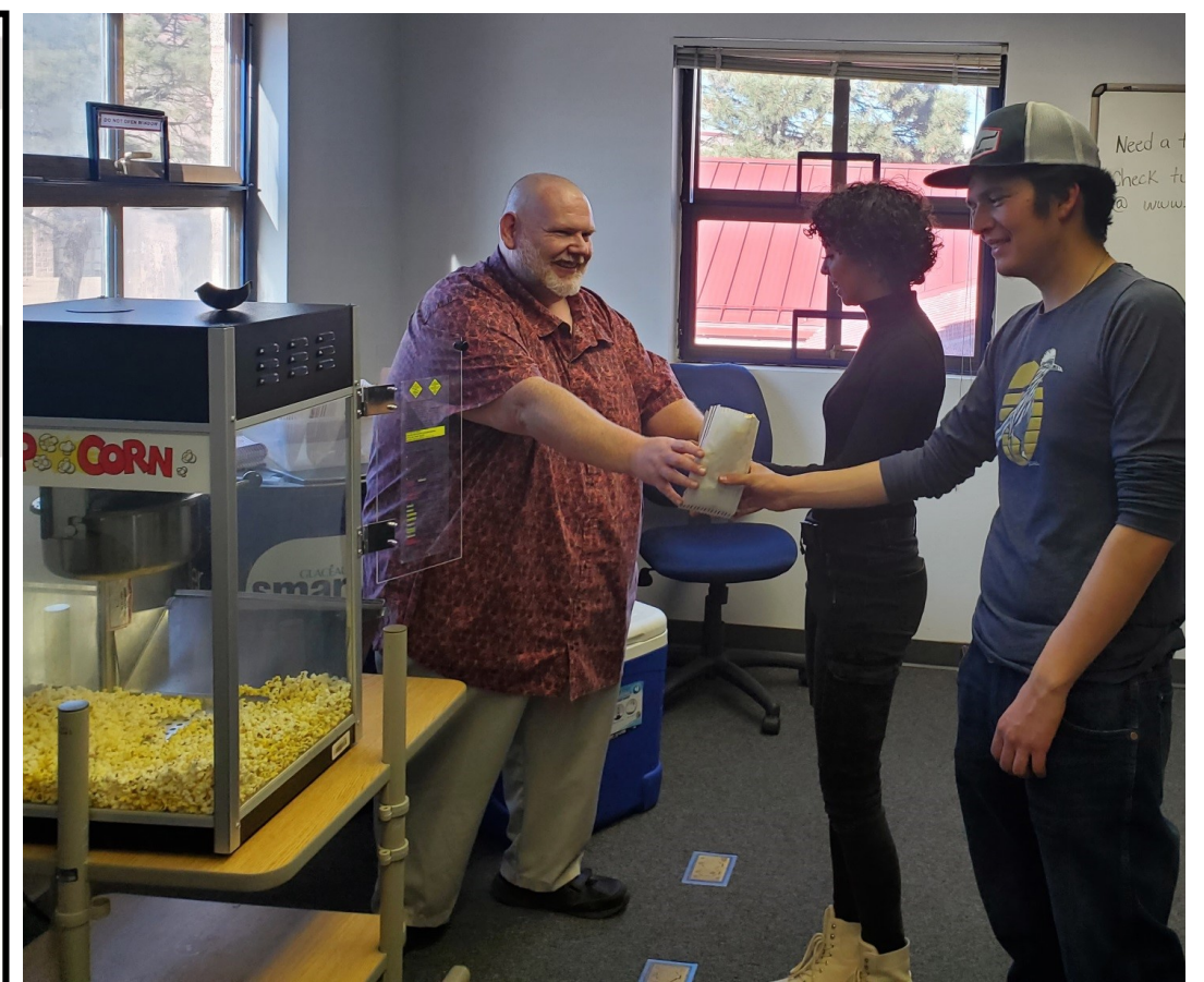
Luna students enjoy popcorn during last week's POP-IN STUDY Session event.