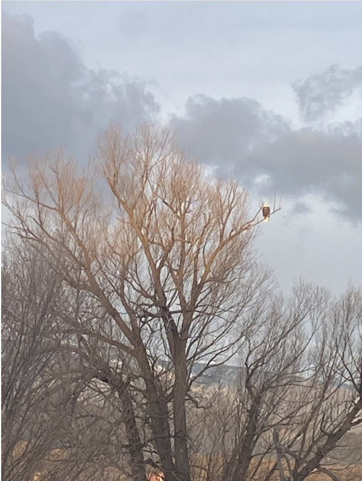
Photo of the edition, submitted by Melissa Cordova, captures the beauty of Mora County. At the top right of the photo, there is a bald eagle perched on one of the branches.