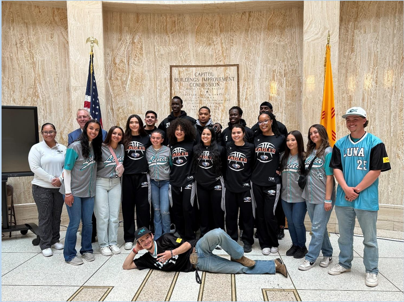
Luna Rough Riders and Northern New Mexico College ball teams visited the Round House on Higher Education Day.