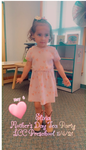
Elvia Mother's Day Tea Party LCC Preschool 5/6/21