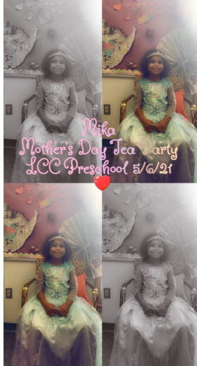
Mika Mother's Day Tea Party LCC Preschool 5/6/21