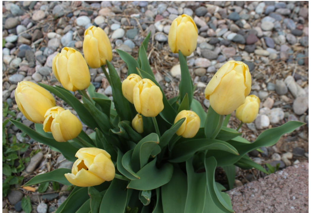
PHOTO OF THE EDITION: Signs of spring arriving here at Luna Community College are in abundance, as this beautiful tulip outside of the student services building depicts.