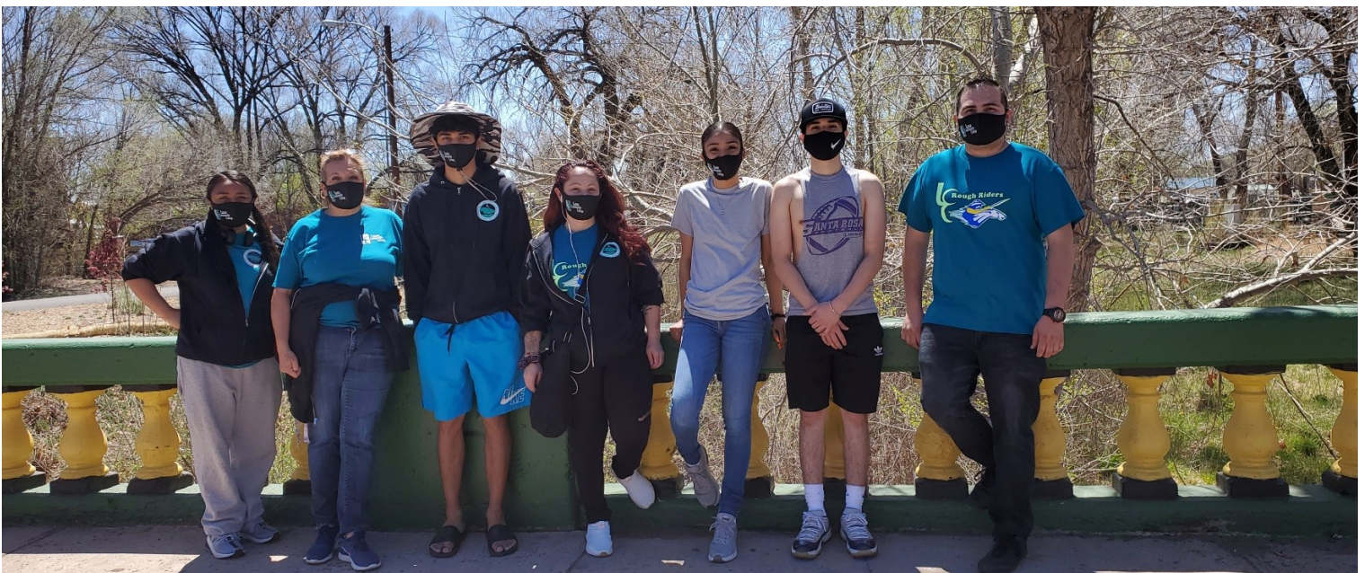
A group of Luna Community College students and employees recently participated in a community clean-up in conjunction with the City of Las Vegas' volunteer partnership group Vecinos Juntos.