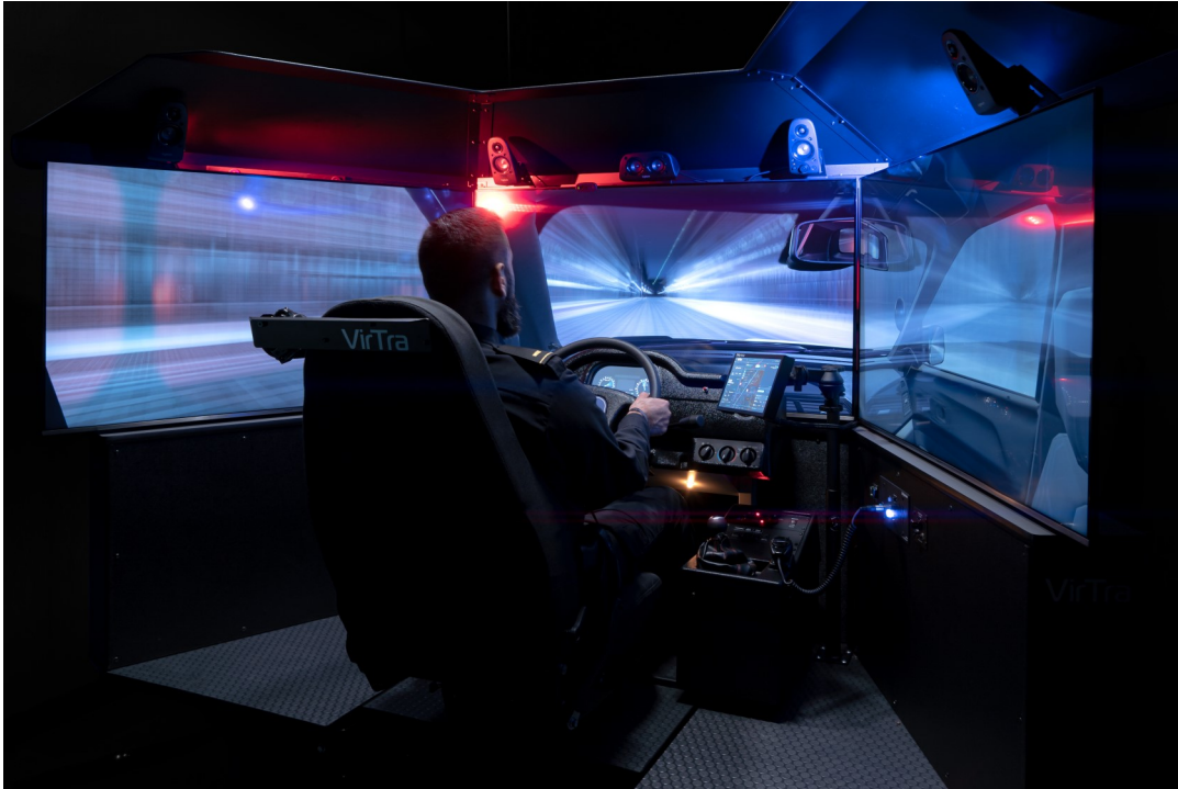
depicts a driving simulator that Luna will be using in its Law Enforcement Training Center.