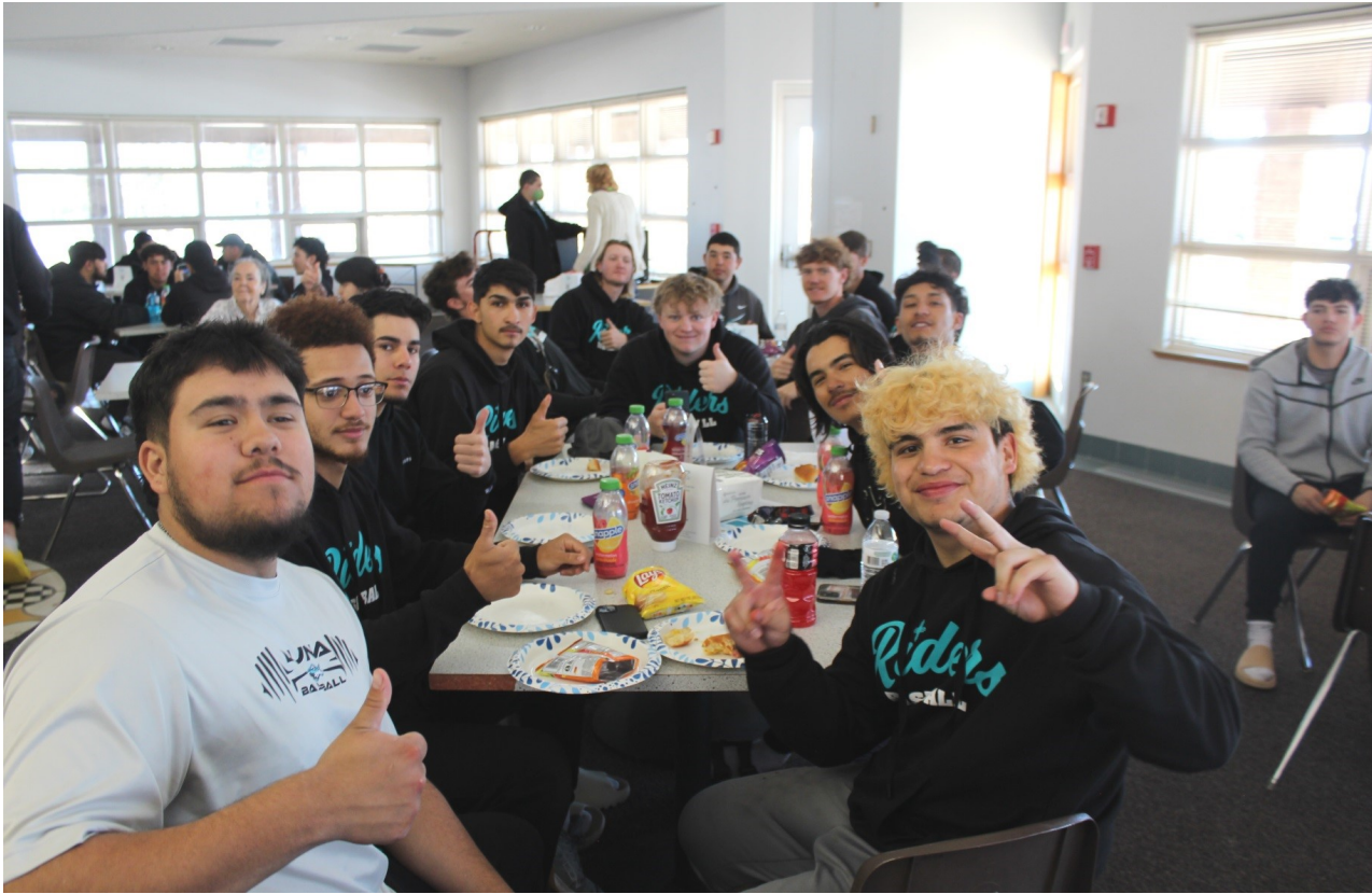
Luna students and employees enjoyed a welcome back barbeque at the college on Tuesday, Jan. 23. Hamburgers, hot dogs, chips were part of the menu sponsored by the student senate and campus life office.

Luna appreciates all the work physical plant employees do throughout the year. In addition, they all work together as a team for special projects such as snow removal.