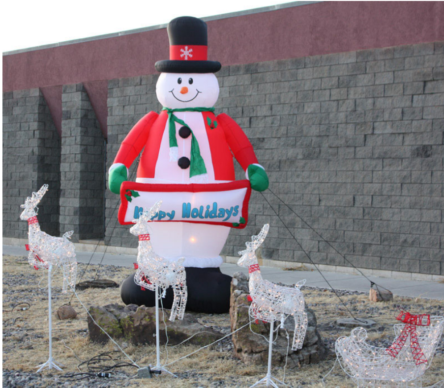
Luna Community College "La Noche de las Luminarias" has been rescheduled for Saturday, Dec. 8. The event, which features themed light displays and hundreds of luminarias across campus, is from 6 p.m. to 9 p.m. It is free and open to the public.

"La Noche de las Luminarias" continues a tradition in which Luna students and employees have taken pride over the years. Four thousand luminarias — the commonly used term for farolitos, paper bags illuminated by candles — are set up in a decorative display along the sidewalks of the Luna campus. Many other lights and displays will also be on exhibit. La Noche de las Luminarias"