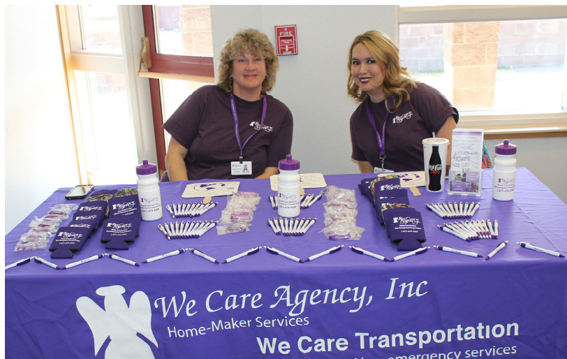
Luna hosted a Health & Wellness Fair on Saturday, Nov. 17. It was a successful event, drawing dozens of exhibitors and hundreds of participants.