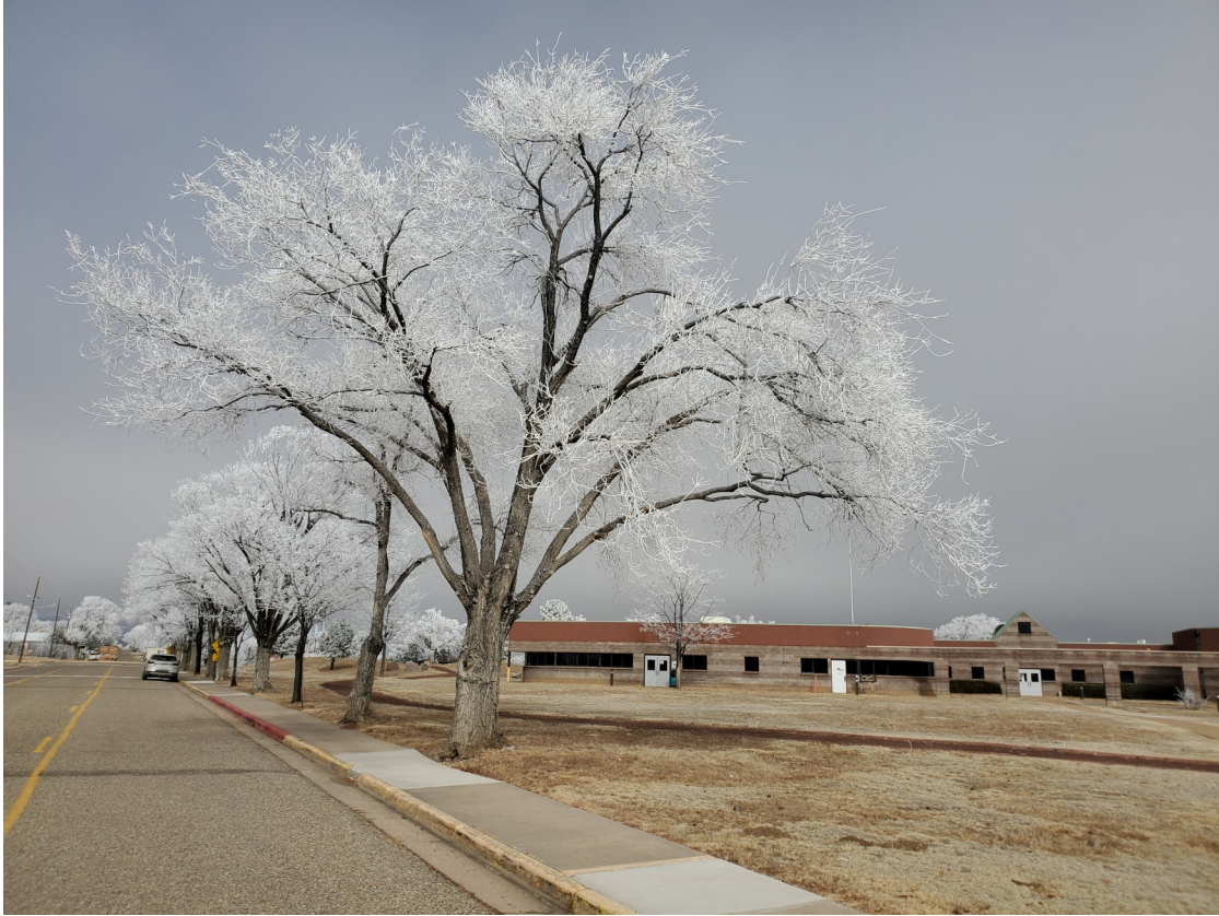
Luna Community College shows its beauty during a recent frost. Luna is one of the most picturesque colleges in the southwest.