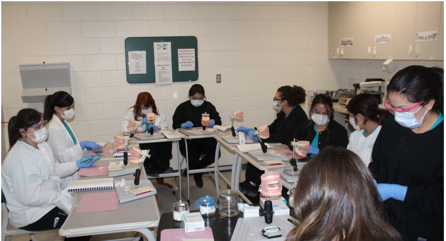
Luna dental assisting students started the new year practicing with lab materials, as they prepare toward proficiency in dentistry. Luna's spring semester began on Monday, Jan. 13. For more information on dental assisting and other Luna programs, call 505-454-2550.