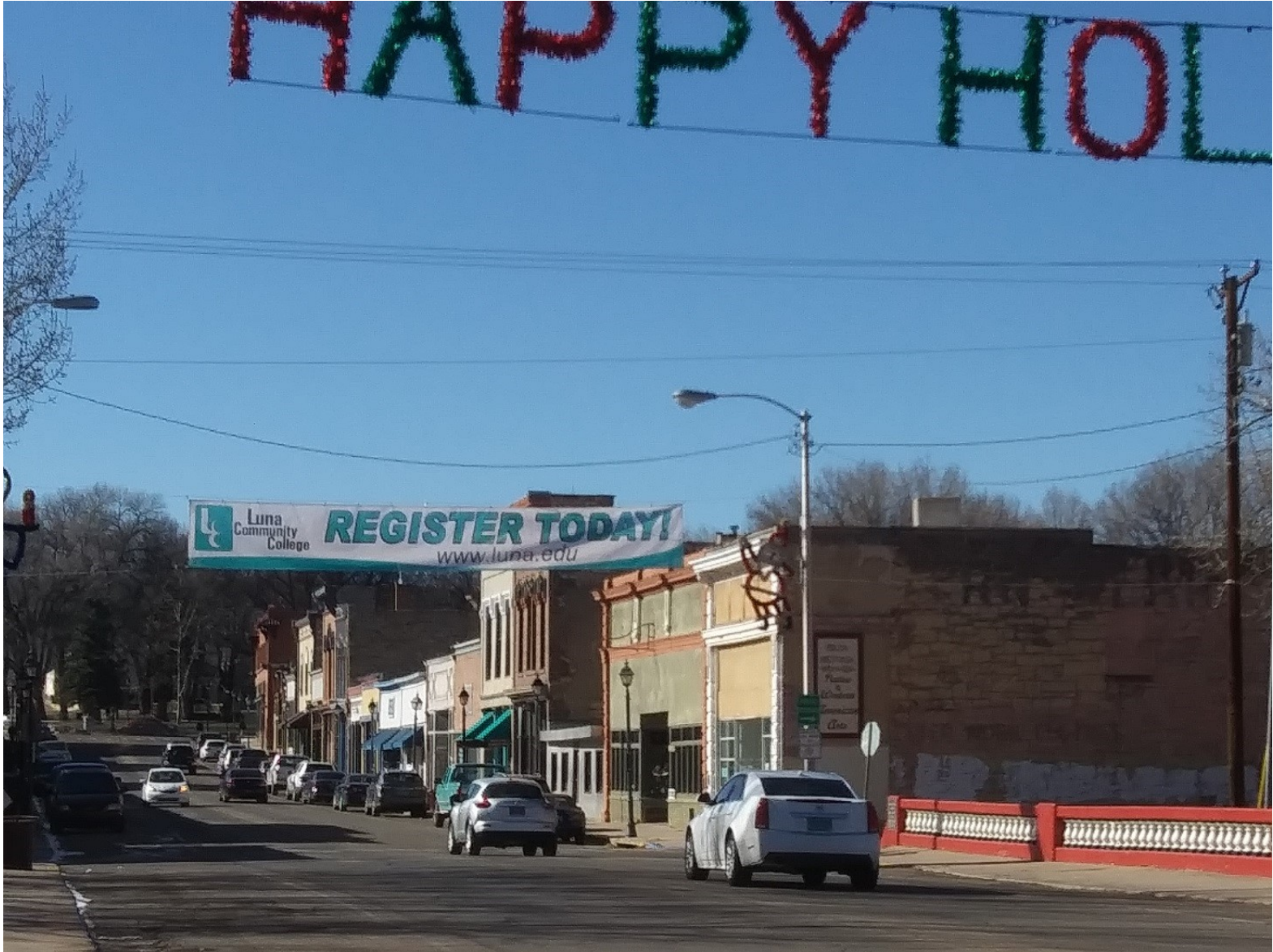
Luna Community College thanks the City of Las Vegas and the public works department for placing a Luna registration banner on National Ave. Spring registration is ongoing and the last day to register is Tuesday, Jan. 26.