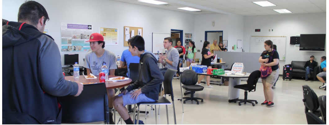
Prior to the COVID shutdown, students made ACE (sometimes known as the ACE Lab) a popular gathering spot for studies and tutoring.

Founded in 1952, the National Student Nurses Association is a non-profit organization for students enrolled in associate, baccalaureate, diploma and graduate nursing programs. It is dedicated to fostering the professional development of nursing students.