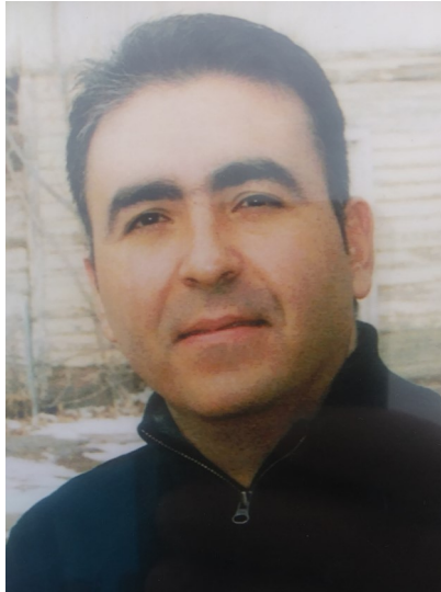
By Jesse Gallegos A Different Perspective

There are so many laws and policies that we live