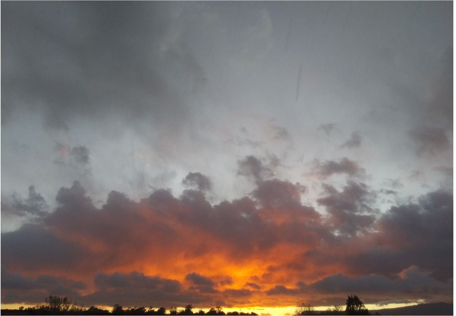
This picture was taken on Wednesday near Sunshine in El Valle. Northern New Mexico is known for its picturesque scenery.

This file photo of a Luna graduation serves as a reminder to continue to strive and never give up on your aspirations.