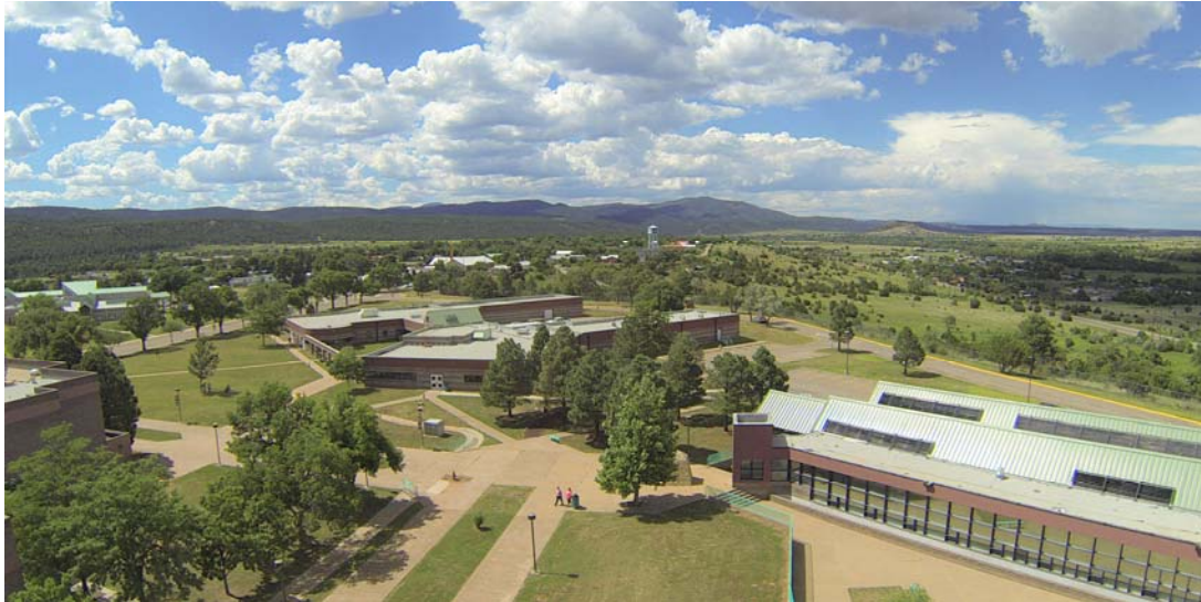
An aerial view shows part of the Luna main campus along with the scenic high country backdrop with the southern Sangre de Cristo range to the left and the far western reaches of the Great Plains to the right.