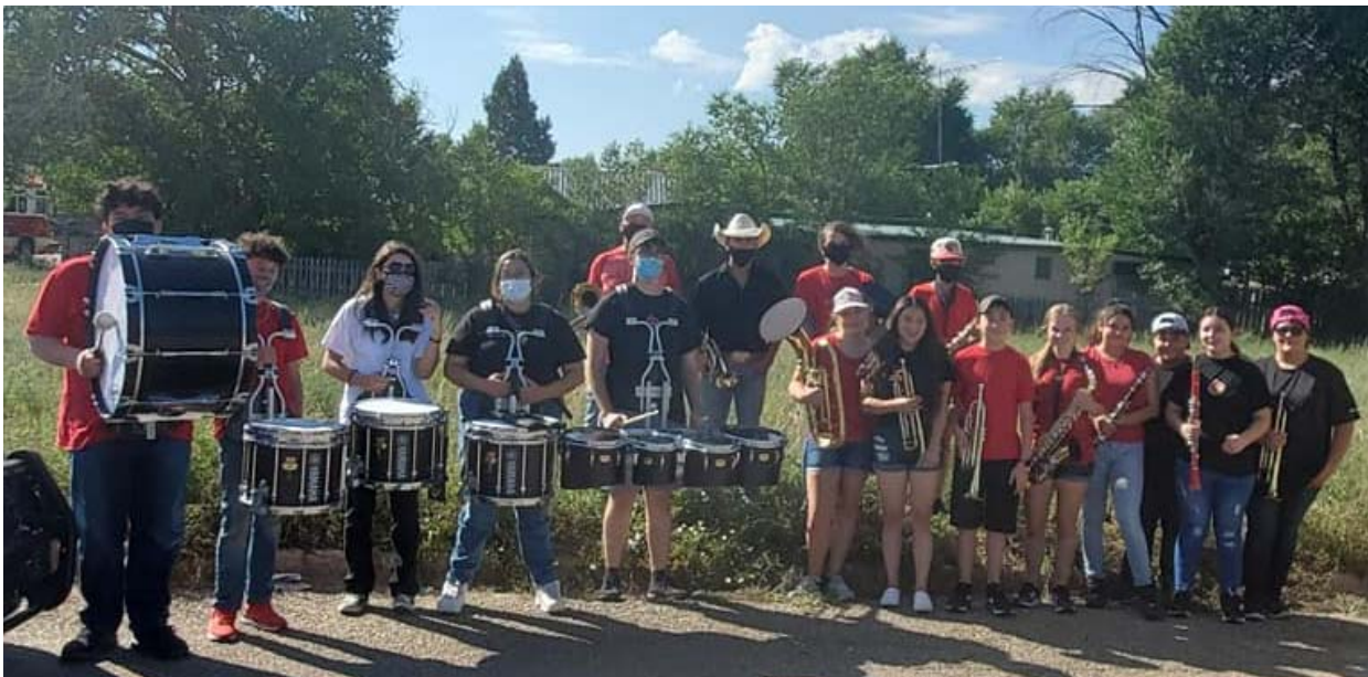
Cheer squads from Robertson and West Las Vegas and the RHS Red Wave Marching Band brought energy to Saturday's parade. At one point, the two groups of cheerleaders engaged in a friendly exchange of "Let's go, Cardinals" and "Let's go, Dons!" chants.