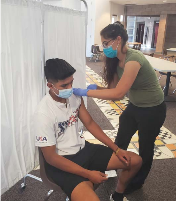
In partnership with the 100% Medical Action Team, Luna hosts a free COVID vaccination clinic on Aug. 25 at the Allied Health cafeteria.