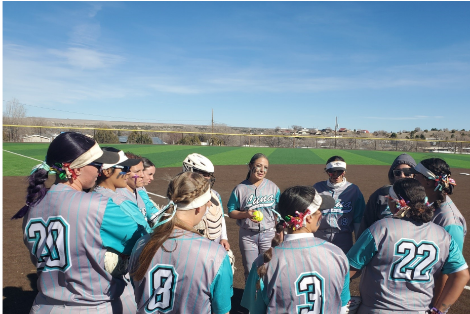
The Luna softball team are pictured here between games last week versus El Paso Community College.

Luna is scheduled to open up Region 9 conference competition this Sunday at Otero. They return home to play a scheduled double-header beginning at 1 p.m. on Mon-