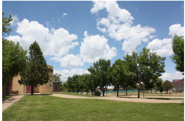
Luna was advised this week that it was removed from probation.