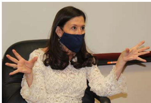
Congresswoman Teresa Leger Fernández talks about the importance of community colleges.

“You cannot describe the emotion I have about having the awesome responsibility to represent this place that is not only the beautiful place I call home but the place that is lodged in every cell of my memory and of my body,” said Leger Fernández. “This is the place